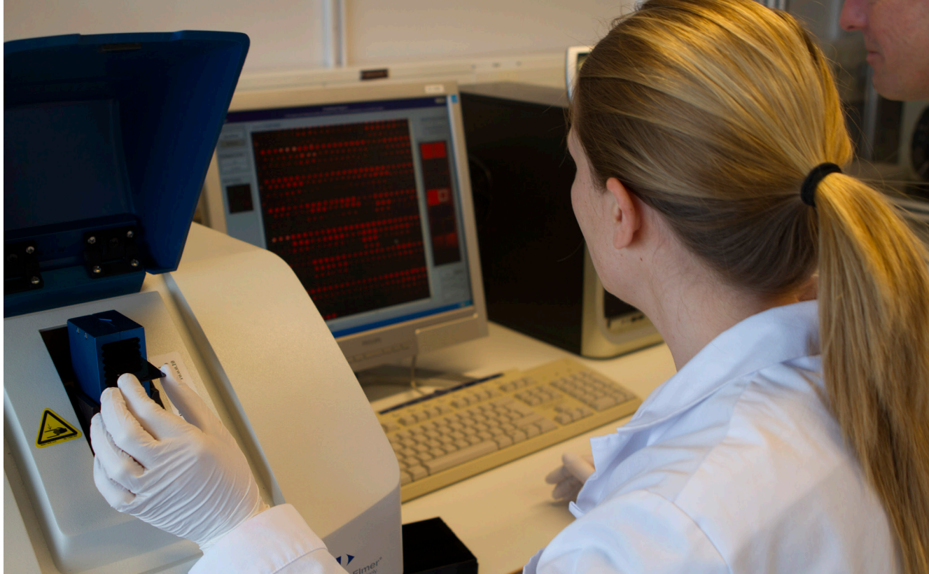
Staff at Immunovia's laboratory in Lund are able to diagnose pancreatic cancer using a drop of blood on a microarray.

operated upon. The 80-85 % who cannot be operated upon because the cancer has advanced too far face a median survival rate of less than six months. If it were possible to detect pancreatic cancer 6-12 months earlier, the proportion of patients who could be operated upon would increase dramatically along with rates for five-year survival.